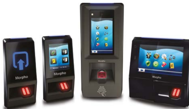
THE SIGMA FAMILY